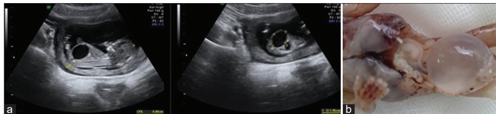
Figure 4: Fourth pregnancy – (a) megacystis, (b) megacystis and hydronephrosis and a distended stomach without microcolon

among siblings of asymptomatic parents with no identified variant in the sequencing. [7,9]